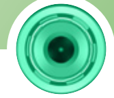
5,0 mm WP