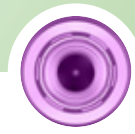
3,75 / 4,2 mm SP